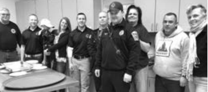
Wells Fire Department, January 18th Warming Day luncheon hosts

The Center opens at 9:30 for games and socializing, entertainment starts at 11:00 and lunch at noon. We have many members who attend each Warming Day. For some of our members, Saturday is the only day that they can get to the